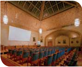
The conference Hall