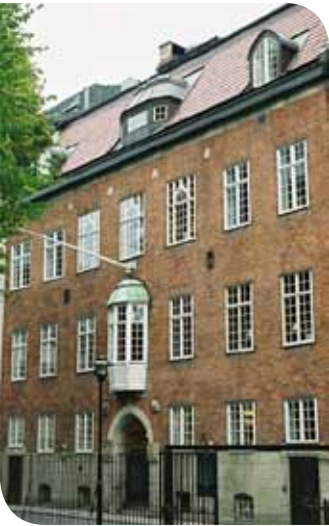
The Society's building at Klara Östra Kyrkogata 10 in Stockholm