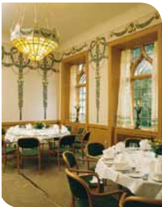
The on-site Restaurant