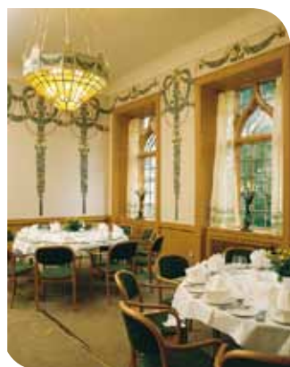
The on-site Restaurant