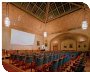
The conference Hall