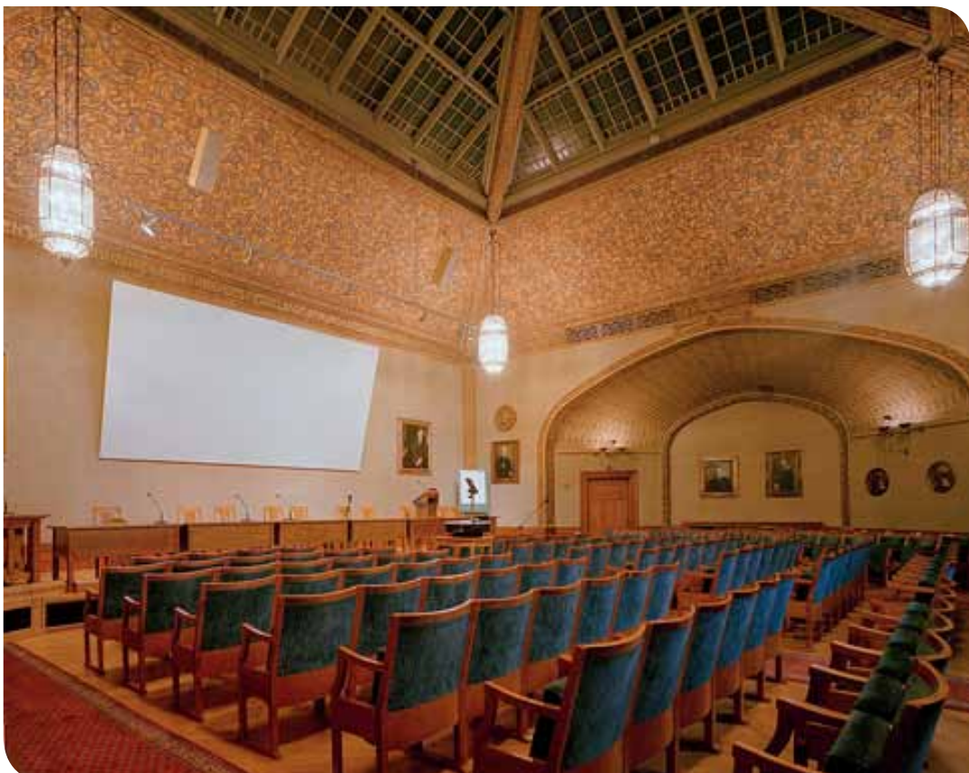
The conference Hall