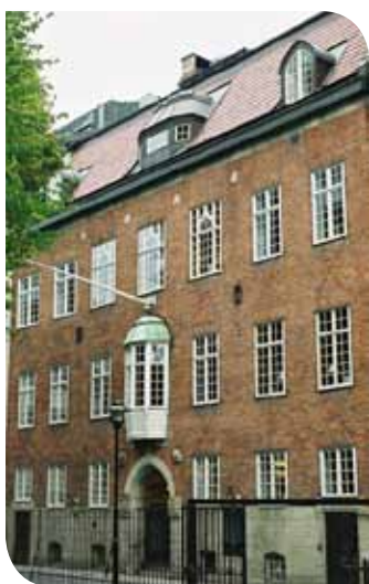
The Society's building at Klara Östra Kyrkogata 10 in Stockholm